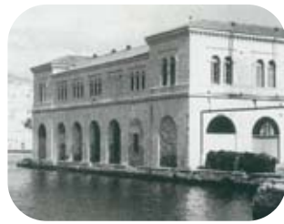
SIROS CUSTOMS OFFICE