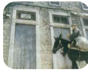
HYDRA CUSTOMS OFFICE