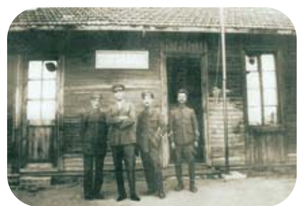
PITHIO CUSTOMS OFFICE

1951 Greece became one of the 13 foundation members of the Customs Cooperation Council (World Customs Organization).