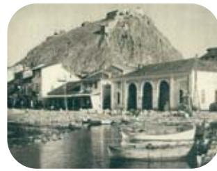
NAFPLIO CUSTOMS OFFICE