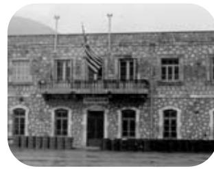
SUDA CUSTOMS OFFICE

1830 Along with the formation of the Modern Greek State, first defensive mechanisms established for the protection of its territorial integrity and for securing the collection necessary resources for the State's functioning was Greek Army and Navy and Greek Customs Administration. On 25/03/1833 in Siros island, the first Customs Office was set up and two years later Customs Offices in Piraeus, Hydra island, Patra and Nafplio started their operation. Greek Customs, therefore, represents one of the oldest Public Authorities of Greek State and today comes under the Ministry of Economy and Finance.